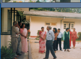
Staff members of the FAPM (2002) at the opening ceremony