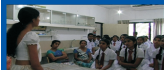
School Programme held at the Dept. of BT on 15 th Feb 2012