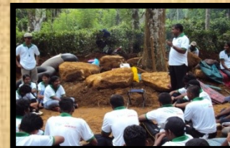
Out Bound Training