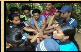
Student Company Programs