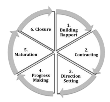
The Mentoring Process

A typical mentoring process can be categorized into three main phases namely clarifying expectation, productive phase and maturation and closure.